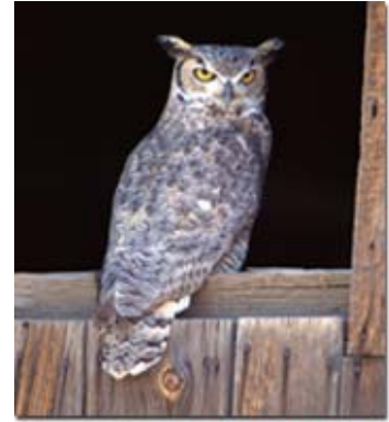
Great horned owl

HABITAT: Cottonwood, green ash, and willow trees are prominent near the riverbank flanked by open grassy meadows. A seasonal irrigation canal loops through the area.